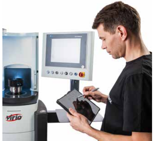
Top-class technology – easy handling and highest precision

Upload a changed set of rotor data from the server, look at the Q statistics on a smartphone or create new set-up data for the balancing machines in the comfort of the office. Or use our online service with remote maintenance and the extensive diagnostics tools – today everything is included naturally. This and much more is possible with our current measuring devices. Our CAB 820 and CAB 920 measuring devices offer you every possibility as standard to integrate them in a network and to communicate with them – exactly according to your wishes and ideas!